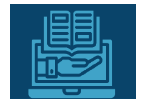
2. The Digital Crossroads training materials and case studies are to help SMEs prevent digital overload. Check It Out Here!

Dive into the training course now the resources are live!